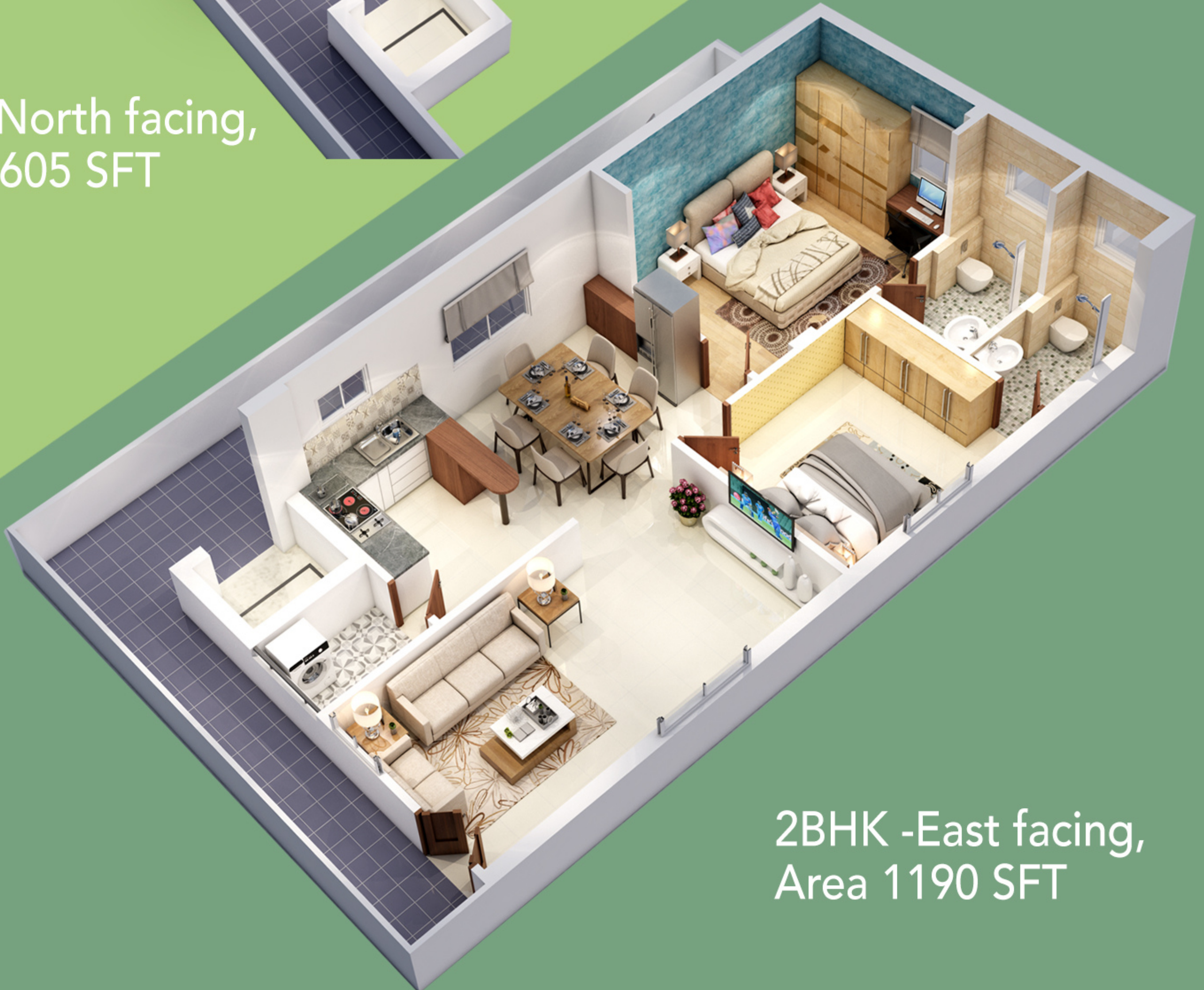
2BHK -East facing, Area 1190 SFT