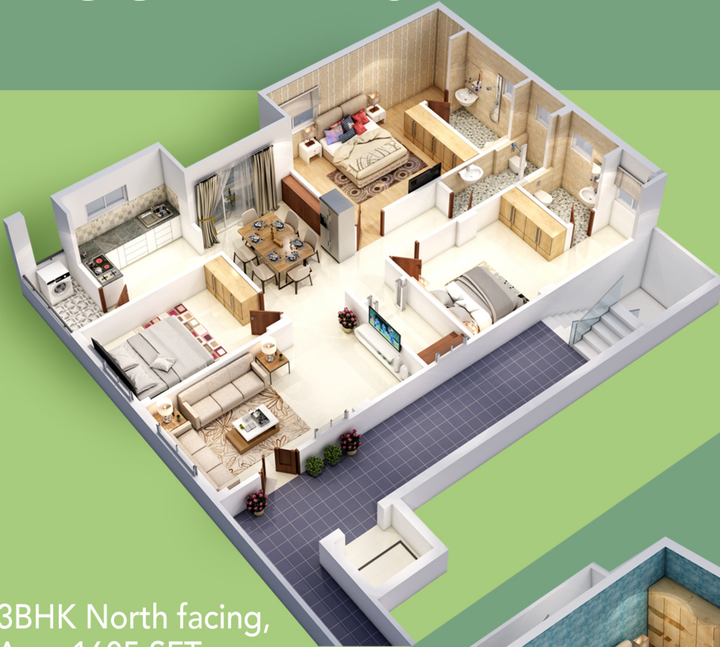
3BHK North facing, Area 1605 SFT